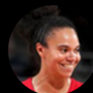
Kristi Toliver Los Angeles Sparks WNBA All-Star