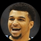
Jamal Murray Denver Nuggets 2023 NBA Champion

Here are Just a Few of the More than 150,000 Players Who Have Graduated From PGC Basketball