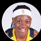
Erica Wheeler Los Angeles Sparks WNBA All-Star