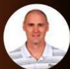
RICK CARLISLE, Head Coach, Dallas Mavericks

PGC is the best basketball camp in America for learning how to think the game.