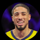
Tyrese Haliburton Indiana Pacers 2x NBA All-Star